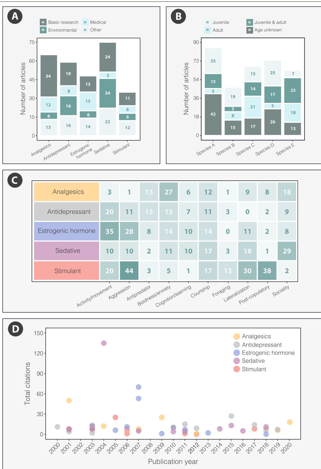
Fig. 2 (See legend on previous page.)